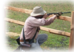
Fence Rail Event

C ompetitions are based on both speed and accuracy in timed events. Awards are presented to the top teams in each of the different competitions.